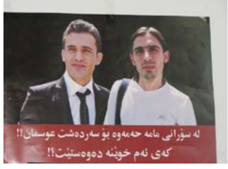
Campaign launched by Awene, Hawlati, Lvin.

During their mission, nearly three months after the murder, Reporters Without Borders' representatives met with the journalist's family, who informed them of their anger and dismay over the inquiry's lack of progress.