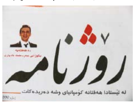
Campaign launched by Rojname.