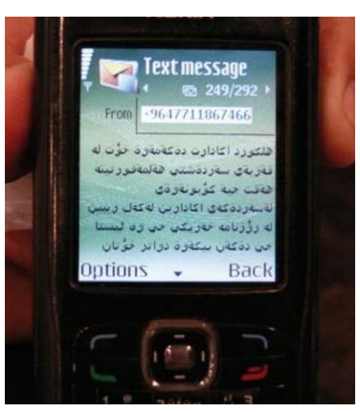
Threatening messages sent to a journalist.

The political party-affiliated media are rarely prosecuted. Aso Hamid acknowledged that no legal action has been taken against his media outlet. He explained clearly that "the channel does not pay the price for" what it broadcasts: in the event of problems or a dispute, those things are settled at a political level between the parties concerned and the Islamic Union. The same applies to Jama'a Islamiya's newspaper Komal.