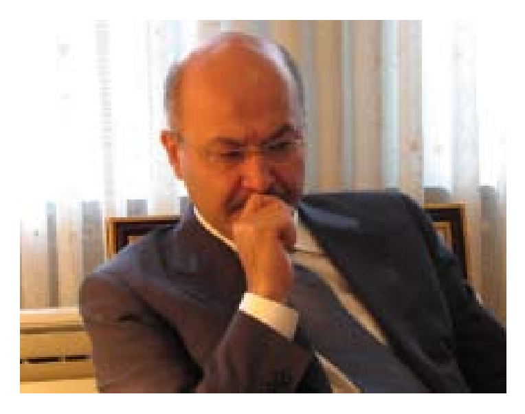
Dr Barham Salih, KRG Prime Minister.

Dr. Barham Salih, the current Prime Minister, stated: "I want a free press, but the current situation is tantamount to anarchy, and that could be used against press freedom. What is necessary is to regulate the current system."