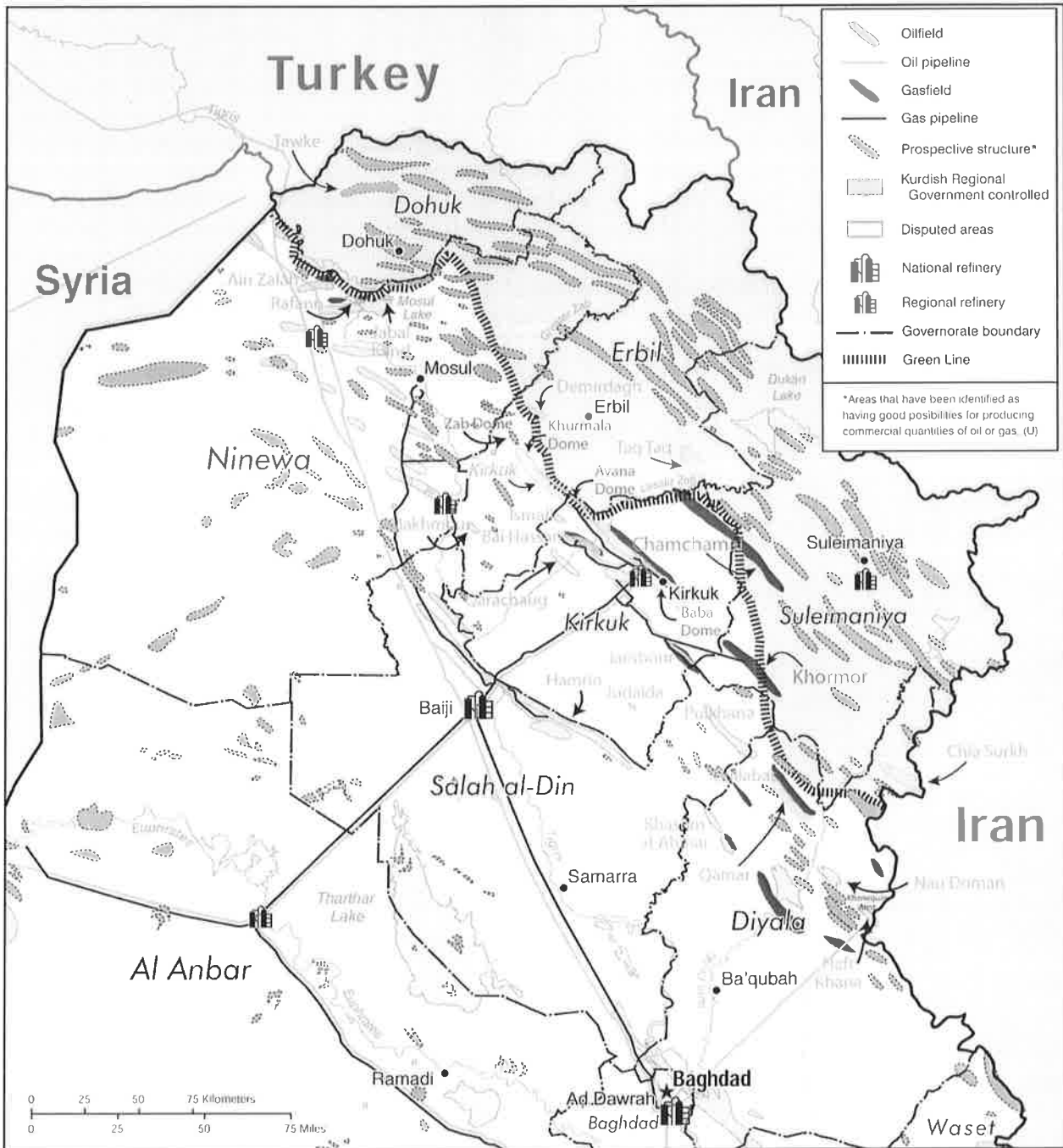
This map has been adapted by the International Crisis Group from a map made available by the U.S. Government. The Kurdish Green Line has been added, and the border of the "Disputed areas" adjusted to add more detail.