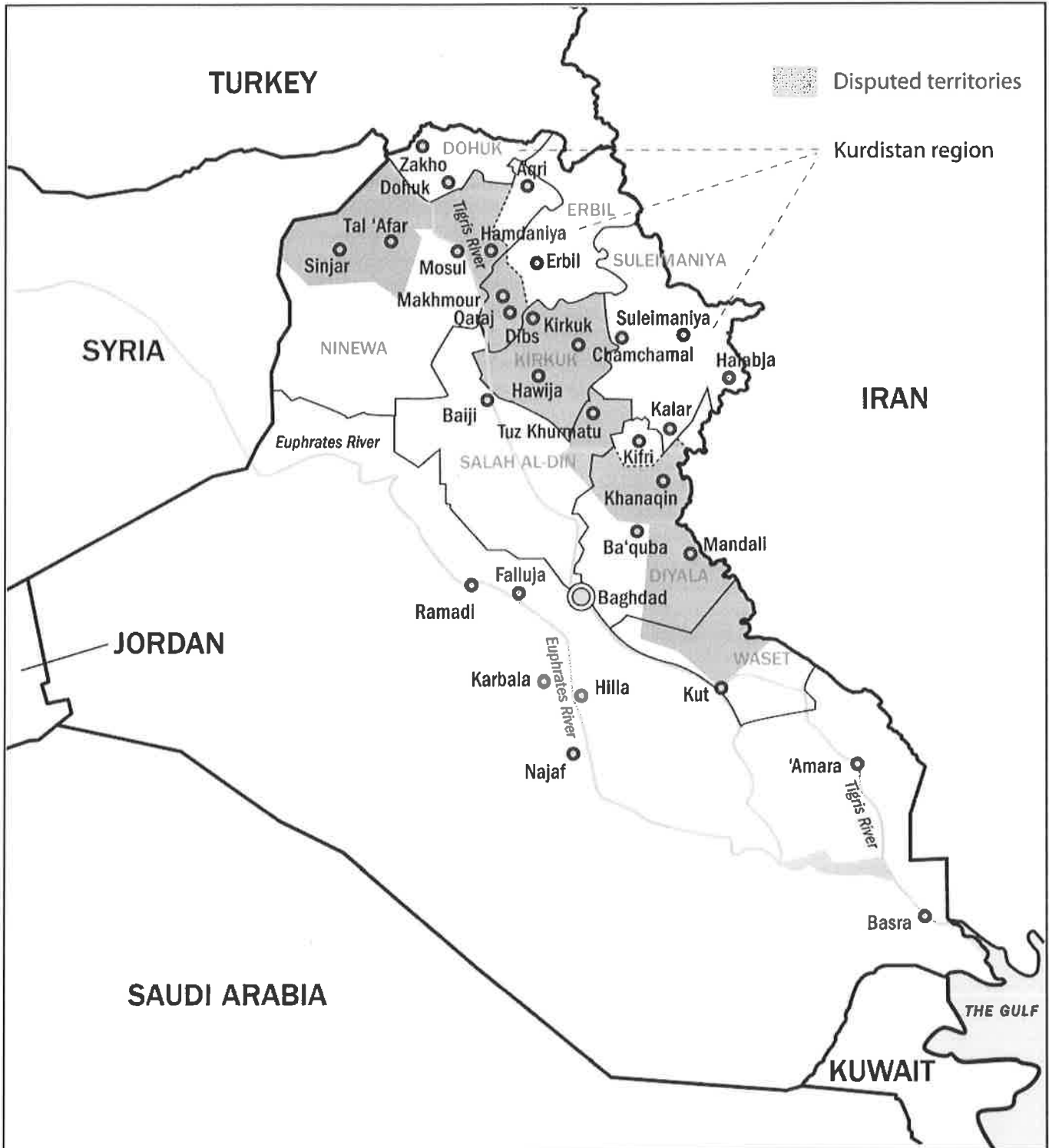
This map was produced by the International Crisis Group. The location of all features is approximate.