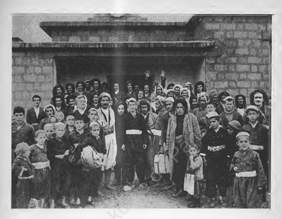
A representative of the Democratic Party of Kurdistan (centre) poses with local inhabitants outside an Iraki Army fort captured and destroyed by the Kurdish Army in Sangsar, North Kurdistan.