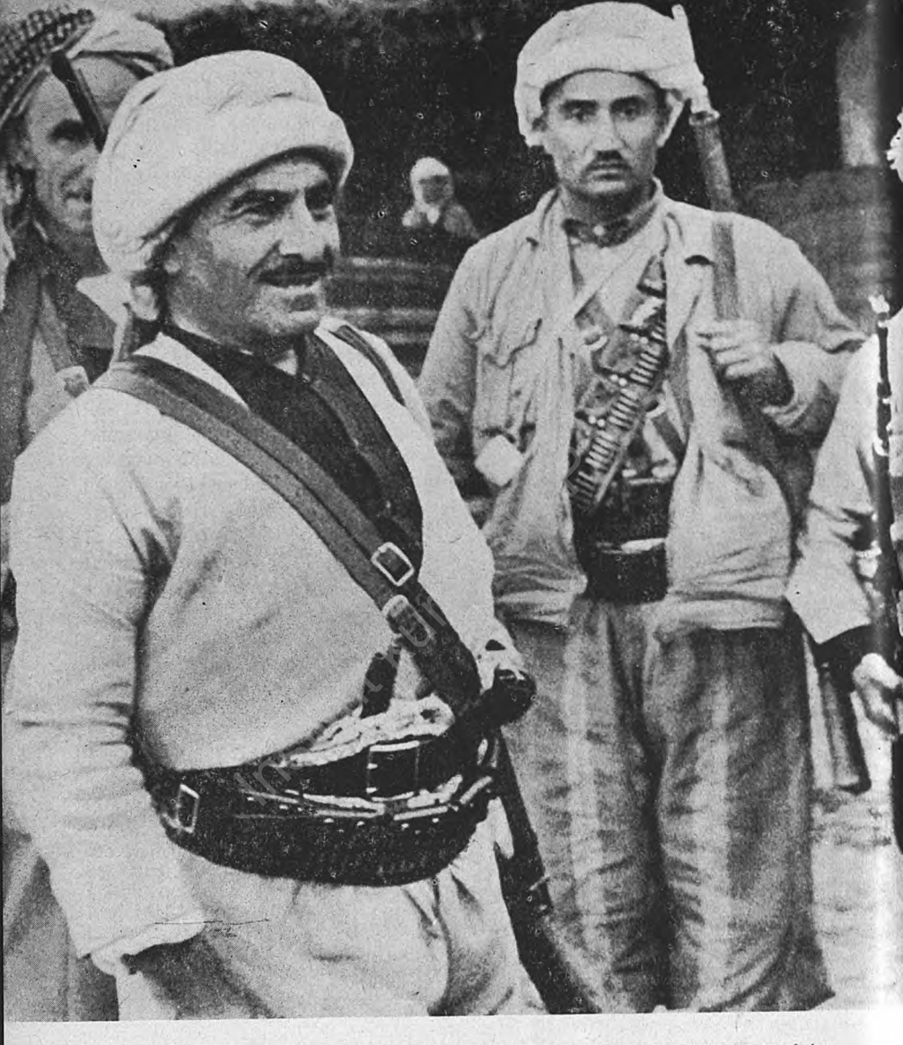
General Barzani inspecting a unit of the tough guerrilla fighters who make up the forces of the Revolutionary Army of Kurdistan.