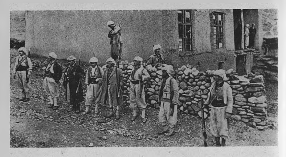
Heavily armed Kurdish soldiers stand guard outside the temporary headquarters of General Mustafa Barzani.