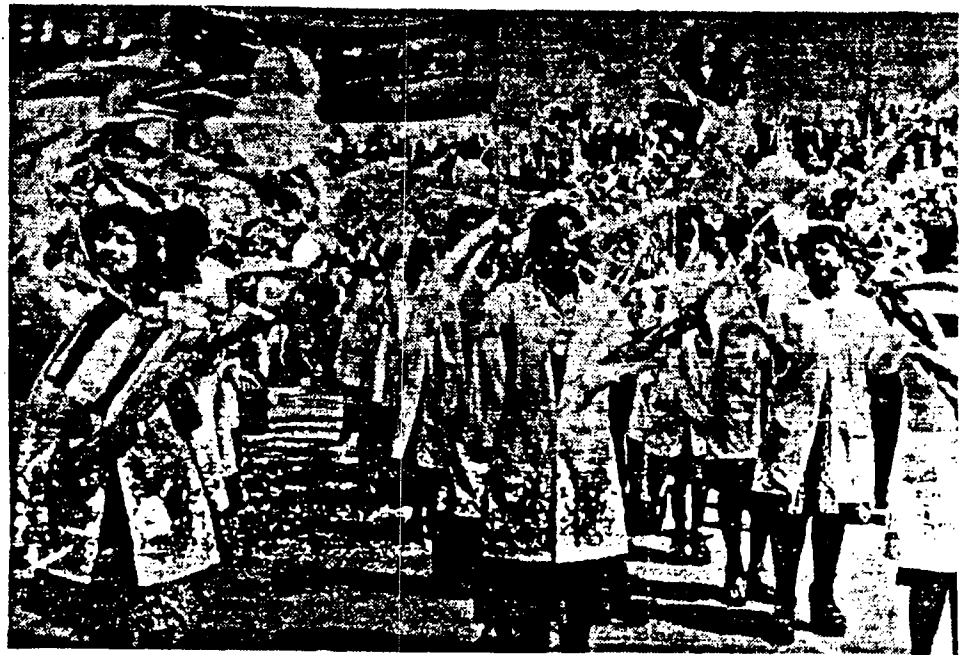
Iraqi women's groups in Baghdad march in May Day parade this year. Unlike neighboring Iran, women wear Western clothes.

No figures are available on how many women have taken jobs during the war, but residents say that the change has been dramatic. Women