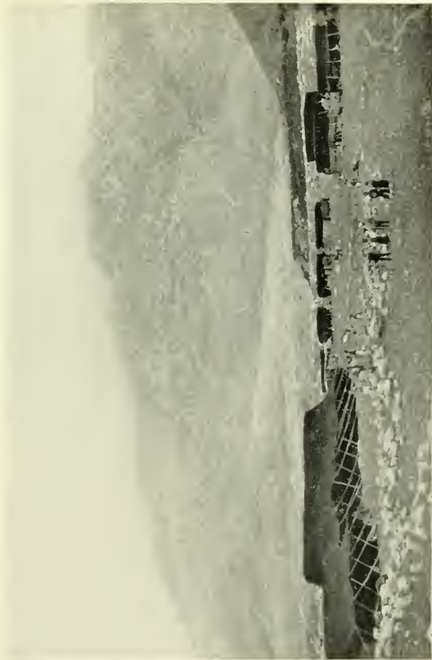
ENCAMPMENT OF JAF KURDS IN SHAHIR-I-ZUR.