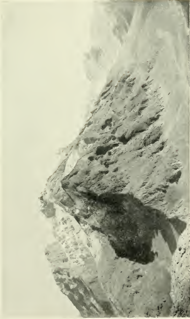
THE KURDISH FRONTIER MOUNTAINS.