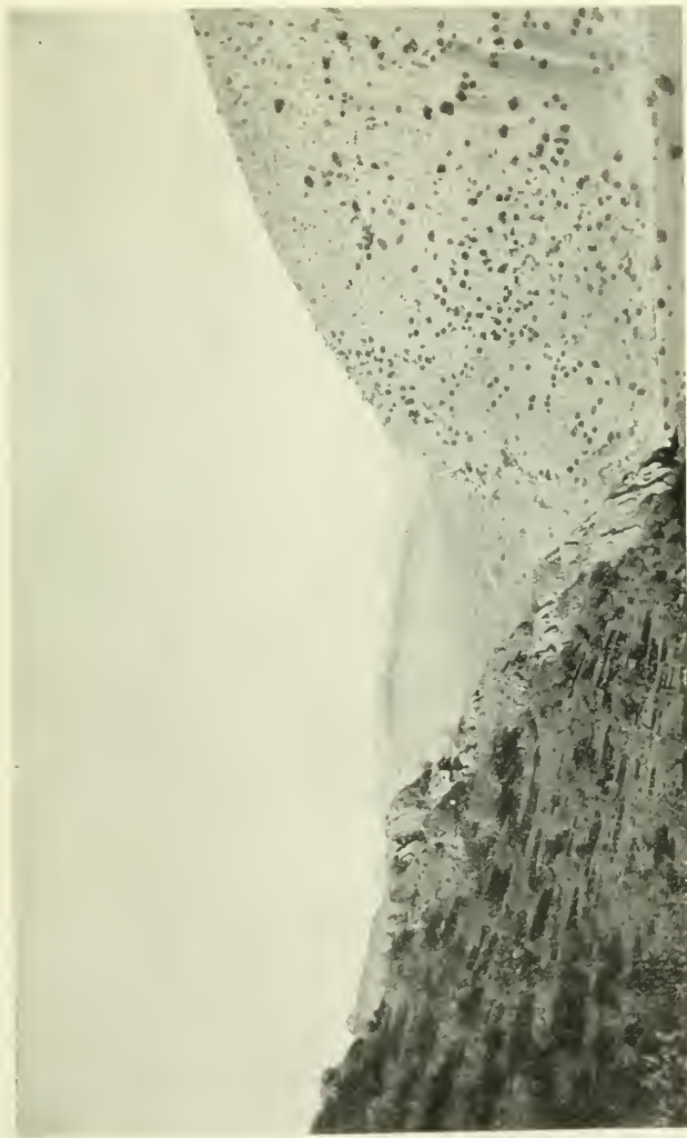
ON THE PERSIAN FRONTIER, S. KURDISTAN.