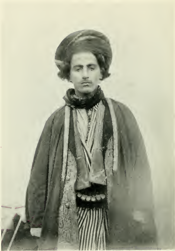
A JAF CHIEF, S. KURDISTAN.